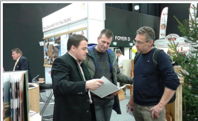
BIM Salzburg - Binderholz